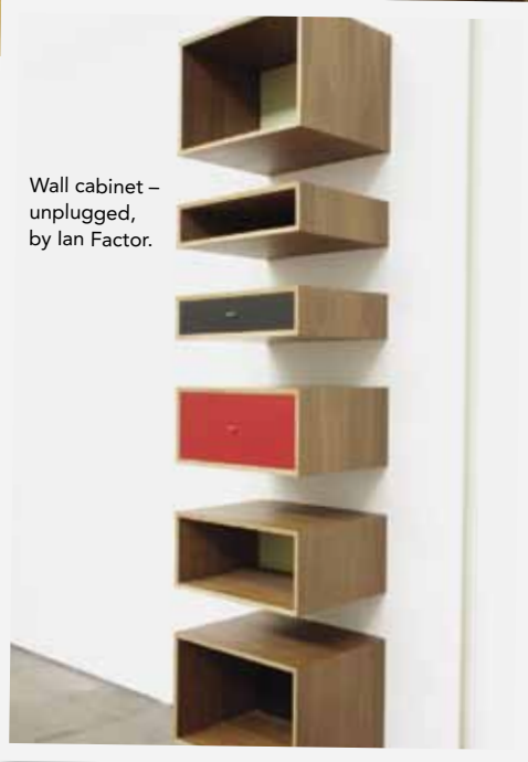
Wall cabinet – unplugged, by Ian Factor.

Factor Design Abstract Furniture Exhibition 25 June to 31 July 2010 Craft ACT: Craft & Design Centre 180 London Circuit, Canberra City www.factor-design.com.au